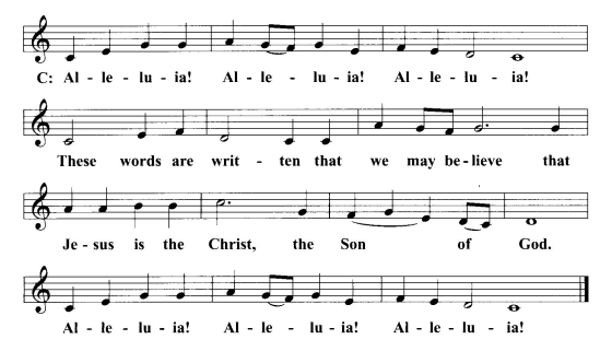
P: Blessed are they who hear the Word of God and keep it.